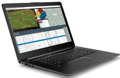
HP ZBook Studio running DVSPORT GameDay

ultra-powerful desktop and mobile devices endowed with the latest NVIDIA® Quadro® graphics cards, and super-crisp HP Z Displays. “HP now is present across the entire Denver Broncos organization,” Trainor says. “From the smaller HP Elite x2 PC Tablets all the way to HP Z Workstations, we believe it’s the best platform on the market.”